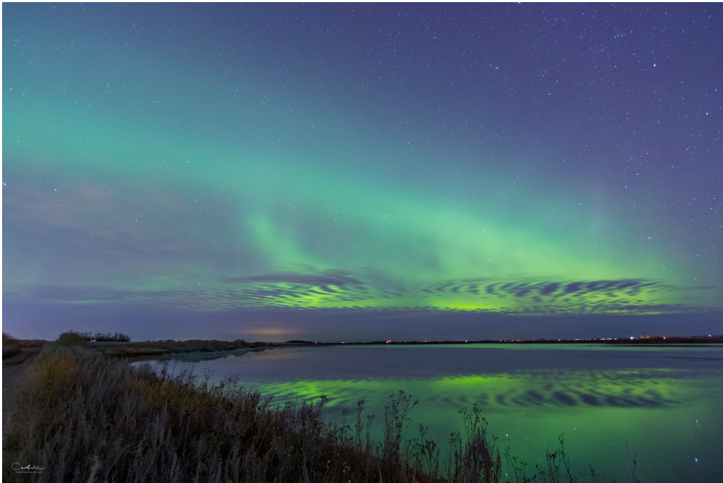
Aurora from the Northeast Swale near Saskatoon on October 24 th. Taken with a Canon 7D MKII and Tokina 11-16mm lens at 11mm, f/2.8, ISO 1600, 20 sec.

Saskatoon Skies is also posted on our Saskatoon Centre homepage as a .pdf file and can be downloaded free-of-charge. Members may choose to receive the newsletter by regular mail or via the Internet. Articles may be reprinted from Saskatoon Skies without expressed permission (unless otherwise indicated), provided that proper source credit is given. Saskatoon Skies accepts commercial advertising. Please email the editor at colcha@sasktel.net for rates. Members can advertise non-commercial items free of charge.