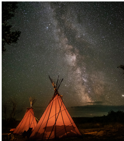
at Grasslands National Park West Block

In conclusion, I hope this update is helpful. Please don't hesitate to contact me at 519-754-1803 or ldiveto@rasc.ca with questions or comments. The continued success of RASC is dependent on member understanding of, and support for, RASC's vital charitable operations and mandate. Thank you for your valued consideration.