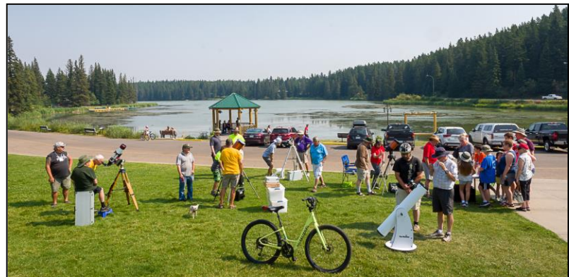
[Left] Solar Observing at Loch Leven