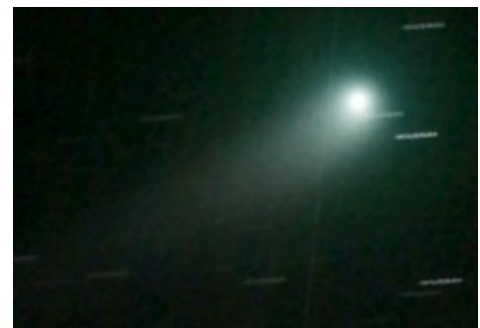
Comet C/2012 K1

In October an asteroid was discovered and named 2013 UQ4. From the start it looked odd for an asteroid for it had a long retrograde orbit, more like a comet. A May 7 photograph showed that it had turned into a comet, and it was renamed C/2013 UQ4 (Catalina). This comet will be brightest on July 10 when it passes closest to earth with a predicted magnitude of 7, not naked eye but a good binocular object. Start looking for it at the beginning of July under moonless skies when it rises into the Andromeda constellation. By the 10 th it will be in Cepheus and travelling 7 degrees a day. By August it will be fading fast.