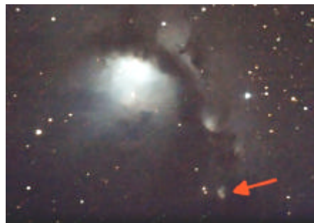
M78 with McNeil's Nebula

One real highlight (and I admit I used the goto for this one) is McNeil's nebula. It's an HH object that I should never be able to see from the city. All I really saw was the dimmest of smudges and in fact had to jiggle the scope to be sure I'm seeing it, nothing to write home about other than the fact that I saw something.... barely.... maybe. Now I've seen it before at