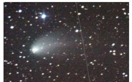
Comet 217P October 17 Canon Rebel XT Camera Orion XT12 Telescope