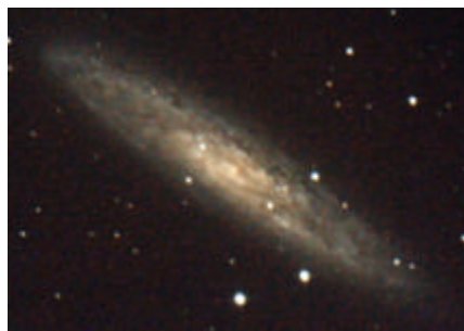
Galaxy NGC253 October 26 Canon Rebel XT camera Orion XT12 Telescope