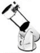
Sky-Watcher Collapsible 10&12"