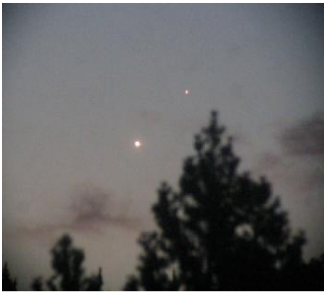
Venus and Saturn through 16x80 telescope

Some years Venus has been close to inferior conjunction during SSSP, like in 2002 and 2004, and it was a good object for daylight viewing due to its large size and pleasing quarter moon shape. This year Venus was approaching superior conjunction, and was small and hard to find. However this year it was in conjunction with Saturn right during SSSP, and both were visible within one low power eyepiece. This would make it worthwhile getting up at 5 a.m. to see it.