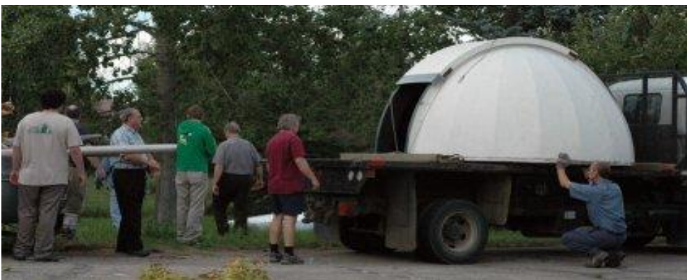
The crew who moved the dome that Al Hartridge was kind enough to donate to the club.