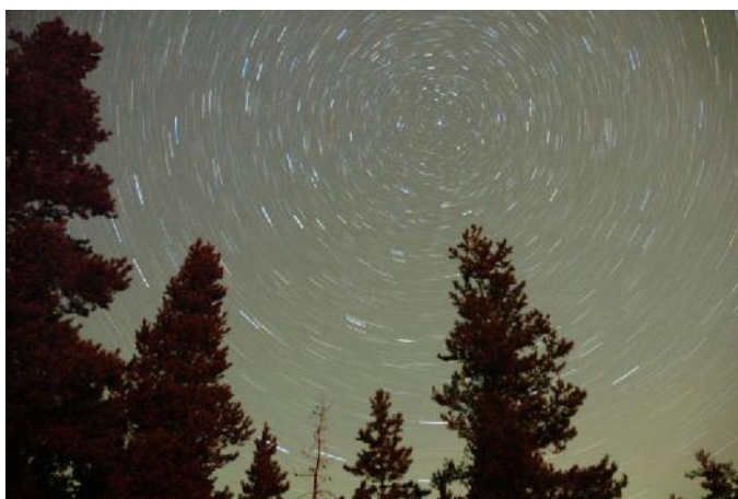
Star Trails at SSSP

Even though I only had the one night of observing it was a very good night indeed and I enjoyed it so much that I will be back again next year. The organizing committee deserves commendation for all their hard work; as well, the staff and management of the Cypress Hills Resort worked hard for all our benefit. Ah, but above all and best was Cypress Hills Interprovincial Park herself; once more I've been enchanted by the sounds, smells, and sights of that magnificent park, and once more I promise to return next year!